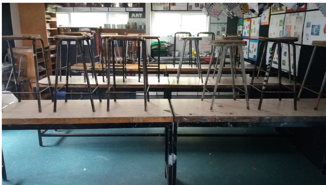
4 tables & 4 stools left