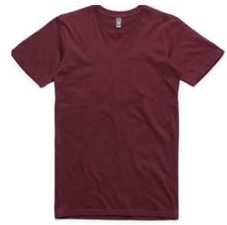
Colour indication only