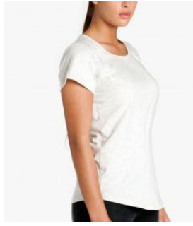
Women's shirt style